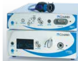
3MOS CAMERA SYSTEM